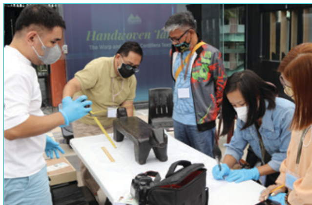
HEI participants for the Museum Management Training with their handling of artifacts during the Collections Management Training at Museo Kordilyera, UP Baguio.

This project aims to contribute to the global targets of SDG 4 (Quality Education) by promoting equitable quality education and life-long learning for all through the production of virtual museum tours and making these accessible. It will also continue UP Baguio's track in SDG 11 (Sustainable Cities and Communities) by increasing the Universities that act as custodians of heritage and environment in and on the Cordillera, Northern Luzon, and the rest of the Philippines.