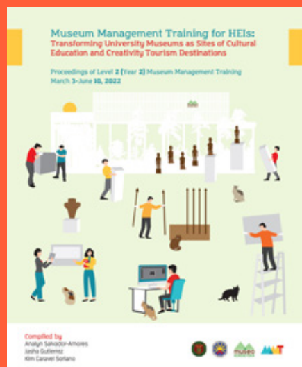
MMT Level 2 Proceedings